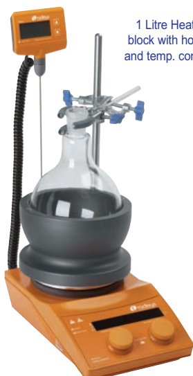
1 Litre Heat-On block with hotplate and temp. controller