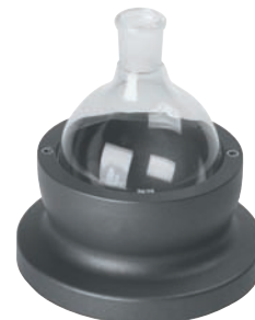
500ml Heat-On block