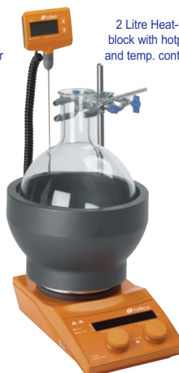
2 Litre Heat-On block with hotplate and temp. controller