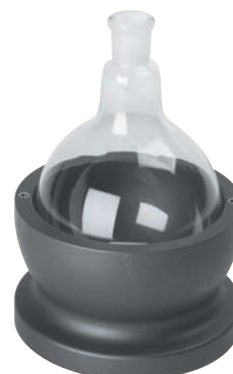
1 Litre Heat-On block