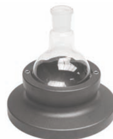
250ml Heat-On block

Each Heat-On block (250ml, 500ml, 1 litre, 2 litre, 3 litre & 5 litre) is a stand-alone product that can be placed directly onto your stirring hotplate - these blocks do not use reducing inserts to accept smaller flasks, thereby maximising heat transfer from a single piece design. All single well blocks feature two probe holes and accept the optional safety lifting handles.