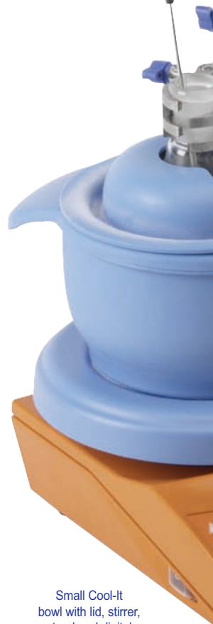
Small Cool-It bowl with lid, stirrer, stand and digital thermometer

Cool-It bowls are manufactured from a robust, chemically resistant HDPE casing encapsulating a high quality insulated foam core. The combination of tough composite materials not only provides excellent insulation but is also durable, and unlike fragile glass dewars, Cool-It is virtually unbreakable if dropped.