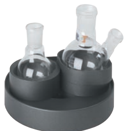
Heat-On Multi-well Block Holder with 50ml and 100ml flask inserts