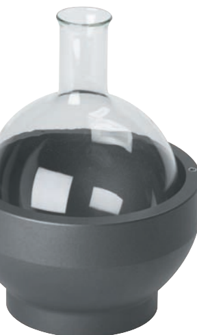
NEW 5 Litre Heat-On block